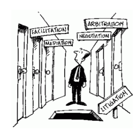
Criteria for being a Mediator?

Under Court-Connected Mediation, Judges refer matters before the Court to the Mediators for settlement.